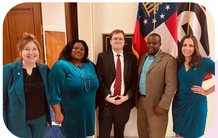
PCOS Advocacy Day