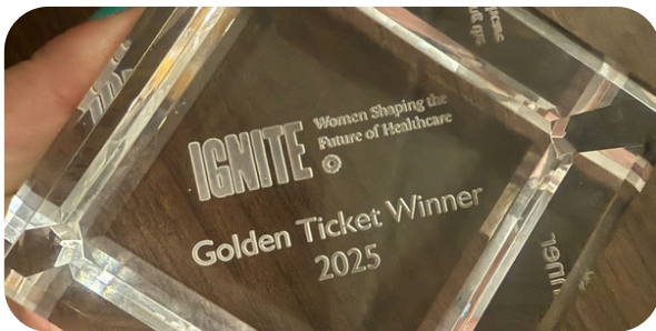
2025 Ignite Accelerator Winner