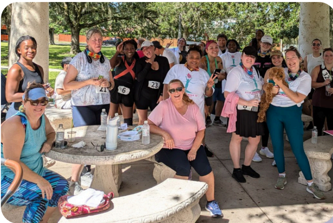
PCOS 5K 2024 - Orlando, FL