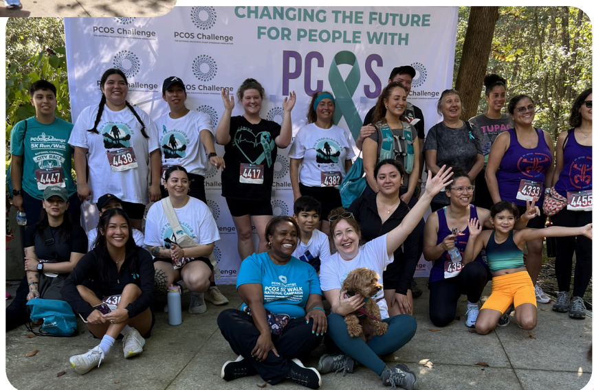
PCOS Trailblazers 5K 2025 - Atlanta, GA in Partnership with PCOS Challenge: The National Polycystic Ovary Association